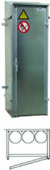
Size Gas bottle facade cabinet model GK 3