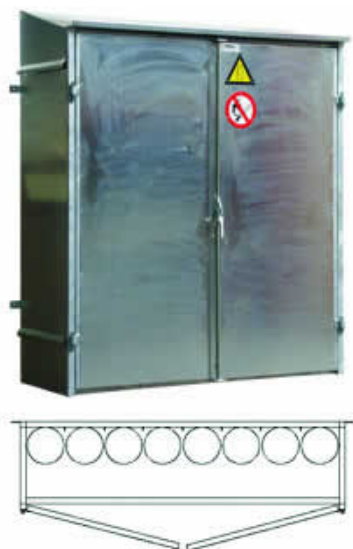
Size Gas bottle facade cabinet model GK 8