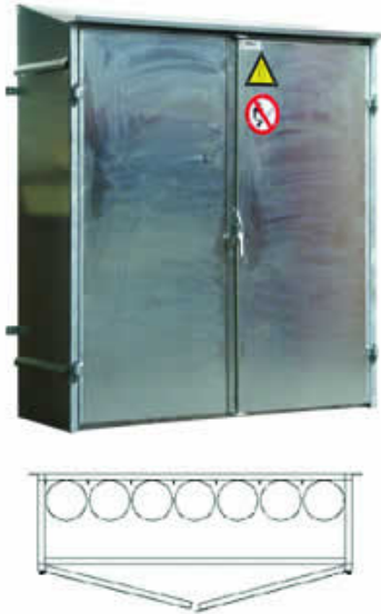
Size Gas bottle facade cabinet model GK 7