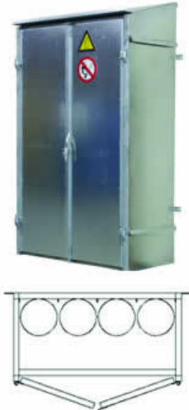
Size Gas bottle facade cabinet model GK 4