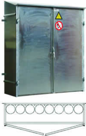
Size Gas bottle facade cabinet model GK 8