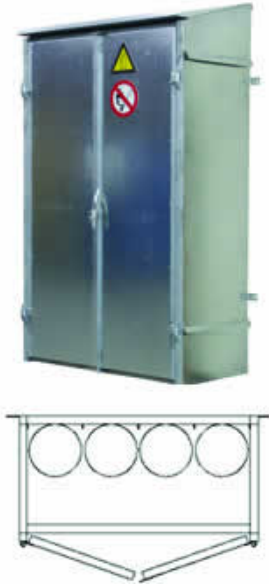
Size Gas bottle facade cabinet model GK 4