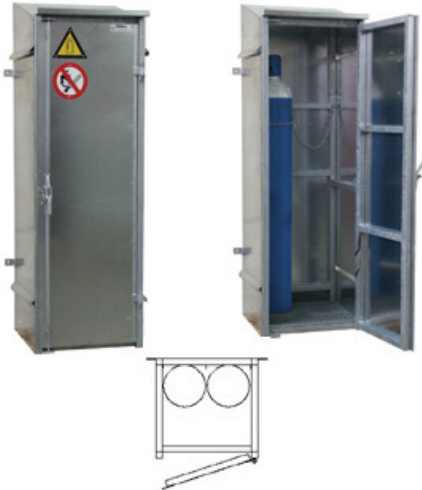
Size Gas bottle facade cabinet model GK 2